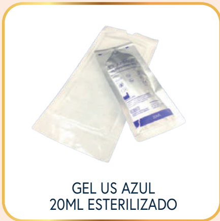
GEL US AZUL 20ML ESTERILIZADO