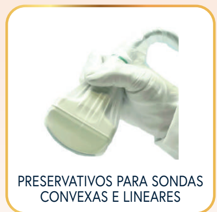
PRESERVATIVOS PARA SONDAS CONVEXAS E LINEARES