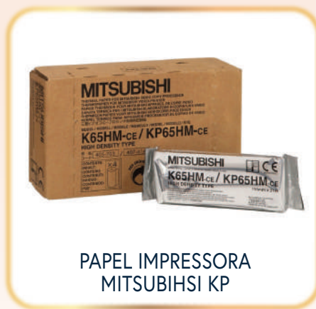
PAPEL IMPRESSORA MITSUBIHSI KP