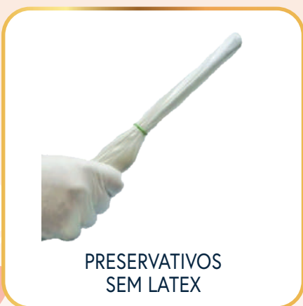
PRESERVATIVOS SEM LATEX