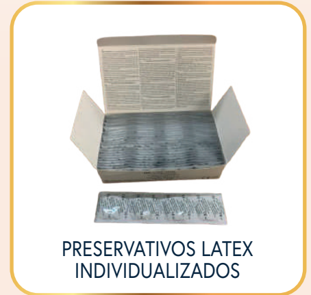
PRESERVATIVOS LATEX INDIVIDUALIZADOS