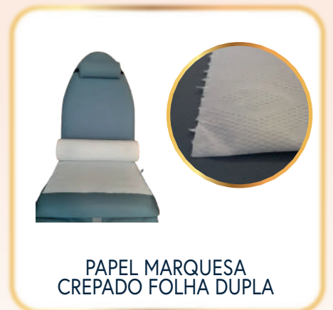
PAPEL MARQUESA CREPADO FOLHA DUPLA