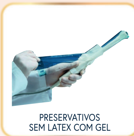
PRESERVATIVOS SEM LATEX COM GEL