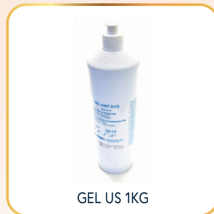
GEL US 1KG