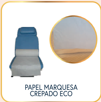
PAPEL MARQUESA CREPADO ECO