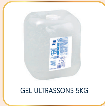
GEL ULTRASSONS 5KG