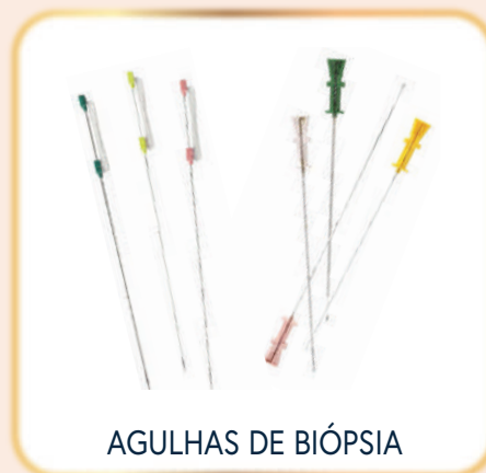
AGULHAS DE BIÓPSIA