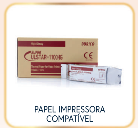
PAPEL IMPRESSORA COMPATÍVEL