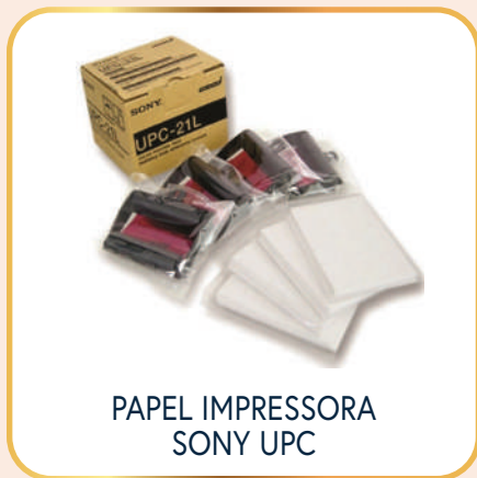
PAPEL IMPRESSORA SONY UPC