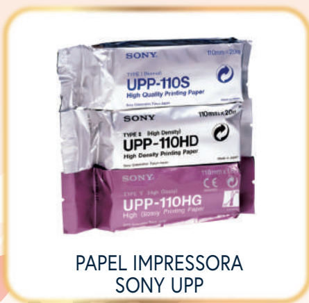
PAPEL IMPRESSORA SONY UPP