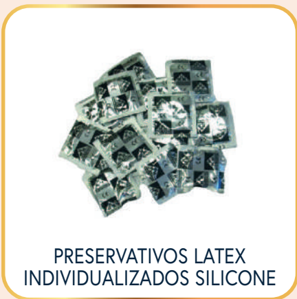
PRESERVATIVOS LATEX INDIVIDUALIZADOS SILICONE