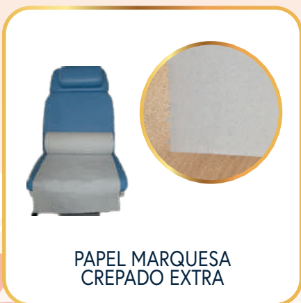
PAPEL MARQUESA CREPADO EXTRA