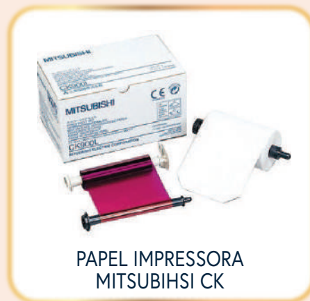
PAPEL IMPRESSORA MITSUBIHSI CK