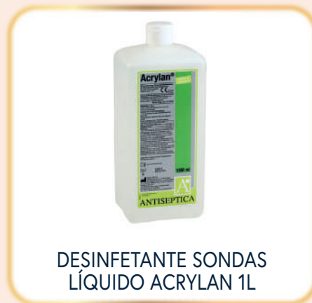
DESINFETANTE SONDAS LÍQUIDO ACRYLAN 1L