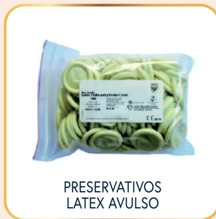
PRESERVATIVOS LATEX AVULSO