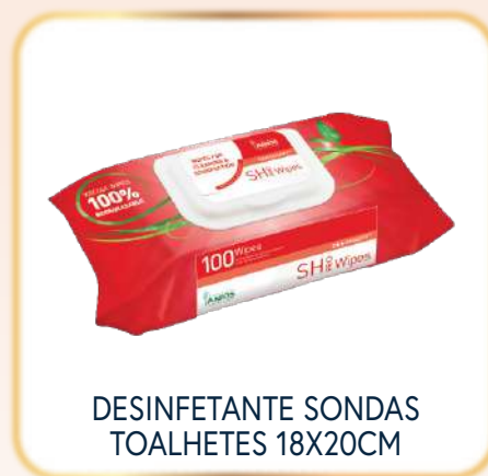
DESINFETANTE SONDAS TOALHETES 18X20CM