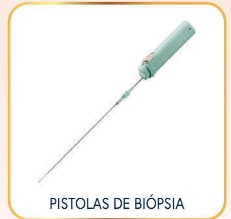
PISTOLAS DE BIÓPSIA