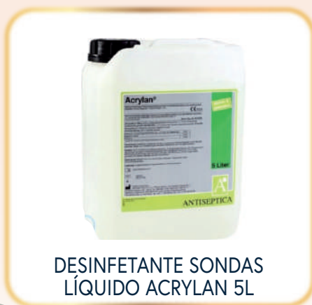
DESINFETANTE SONDAS LÍQUIDO ACRYLAN 5L