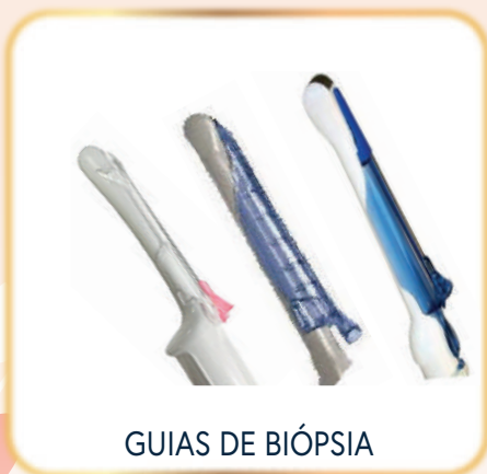
GUIAS DE BIÓPSIA