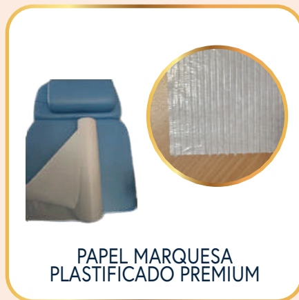
PAPEL MARQUESA PLASTIFICADO PREMIUM