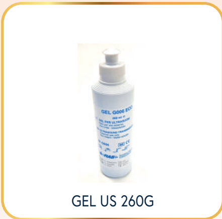
GEL US 260G