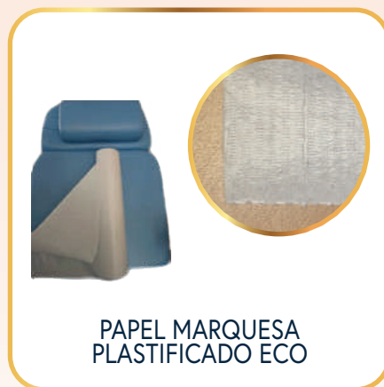
PAPEL MARQUESA PLASTIFICADO ECO