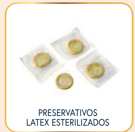
PRESERVATIVOS LATEX ESTERILIZADOS